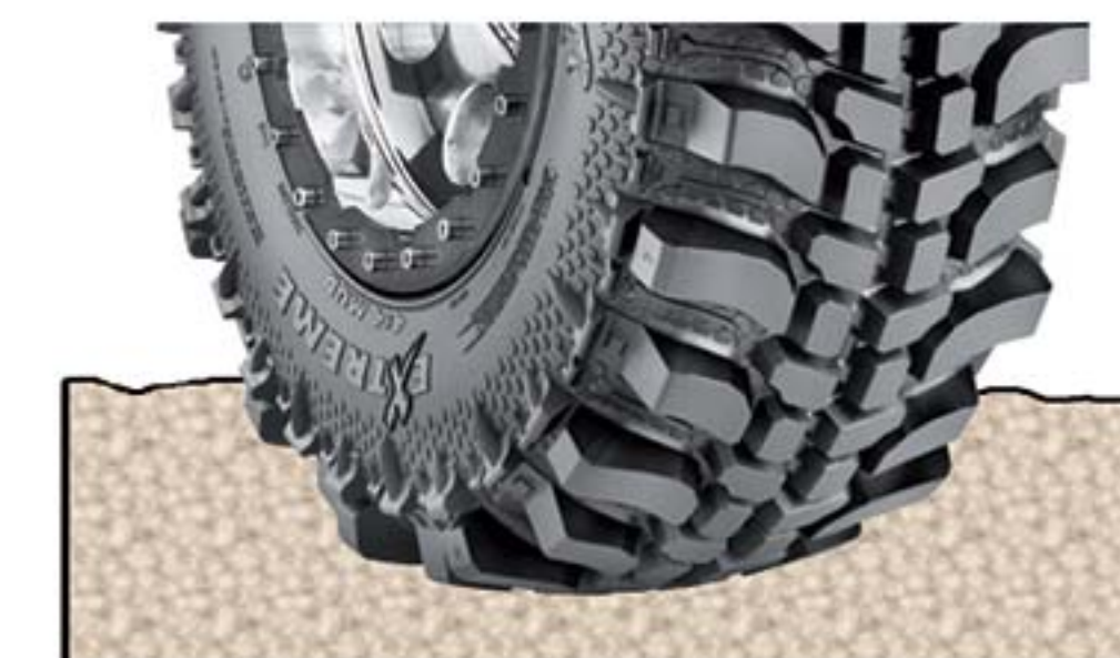
Deep Soft Mud